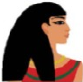
Wife of Potiphar